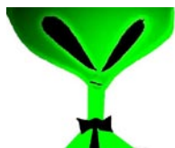
Allen the Alien

“Unique” art can be mentally or physically challenging, underrated, undiscovered, or unrecognized. It can be found in sports, music, performances and in our everyday lives. We promote artists who are disabled, unconventional, extreme, and culturally diverse. We are always searching for something new. Our concept is to find different forms of original and ground-breaking art mediums and bring them together under one roof – a sort of art circus. There are endless art forms that are just waiting to be discovered.